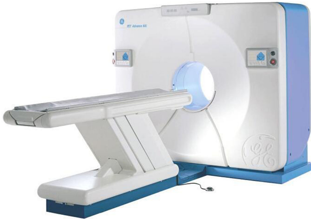
FIG. 2. A commercial positron emission tomography (PET) scanner. Much of the technology underlying this scanner and recent improvements come from particle physics.