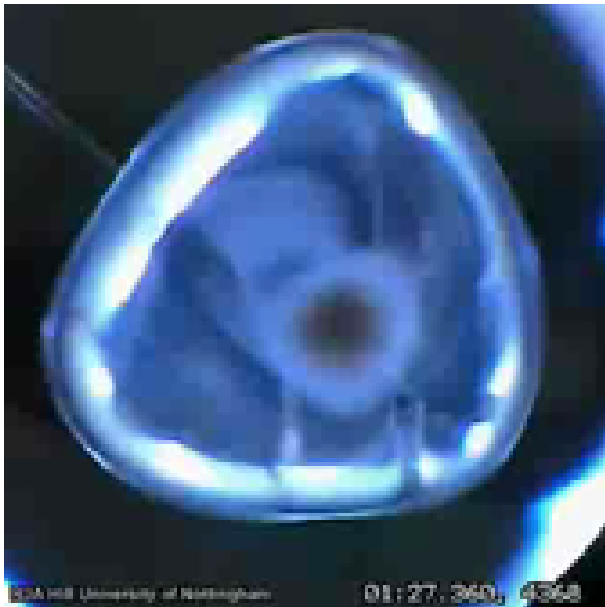
VIDEO 1: The width of the carbon ribbon shrinks until it breaks into two parallel, single-atom strands. (Video: Jin et al. [4]) Video available at: http://physics.aps.org/articles/v/#video .

appears to be visible in the results of the calculations in the auxiliary material of their paper, and this seems to depend on whether the number of carbon atoms in the chain is even or odd.