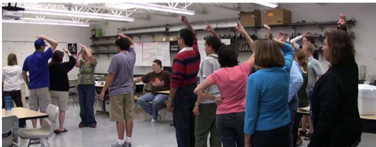
FIG. 1. Teacher enactment of Energy Theater for a hand pushing a box across the floor at constant speed (reproduced from Ref. [38]). Hand signs indicate forms—e.g., fourth person from the left is making a T (symbolizing thermal energy), person in red striped shirt toward the center is making a K (symbolizing kinetic energy), and rightmost person in black cardigan is making a C (symbolizing chemical energy).

Links between PD design and research questions. —In Energy Project PD, teachers apply ETRs to a series of real-world scenarios, becoming more flexible in their use of a theoretical model for energy. We hypothesized that the iterative refinement of teachers’ energy model over time, including the process of negotiation and consensus-seeking that happens as teachers create ETRs for various scenarios, may contribute to the development of positive attitudes