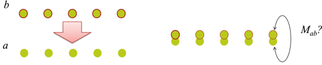
FIG. 2 (color online). We stack two chains in the same nontrivial phase with positive (or negative) index to see if their edge states are stable. With the first chain a = 1 and the second b = 2 , M_{ab} is any coupling between them. We find that all possible couplings are forbidden by our system symmetries, and so the two similar modes are stable and form the N = 2 phase.

two chains containing zero modes with the same positive (or negative) index. This may generalize to larger integers in the \mathbb{Z} group, so now we examine the stacking of two chains with a similar index more systematically.