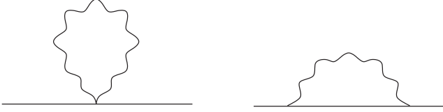
FIG. 2. One-loop diagrams contributing to the fermion propagator. Wavy (solid) lines represent gluons (fermions).