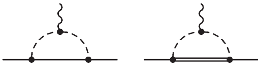
FIG. 1. Loop diagrams contributing to the octet baryon magnetic moments at \mathcal{O}(\varepsilon) . The photons are pictured as wiggly lines, mesons are denoted by dashed lines, and thin solid lines denote 1938 baryons, while the double lines denote 1086 baryons.

To calculate these diagrams and the tree-level contributions, we must extend the electric charge matrix \mathcal{Q} , which is not uniquely defined in partially quenched theories [69].